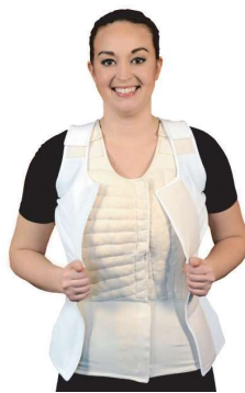
Vest with JoViJacket