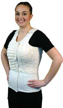
Vest with optional Full Padding (shown with vertical & horizontal padding options for illustration)