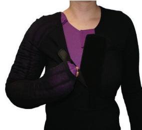
Unpadded torso with One Piece Arm Sleeve & recommended JoViJacket (JoViJacket is an additional charge)