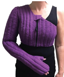
Optional Padded Torso & One Piece Arm Sleeve (This option is an additional charge)