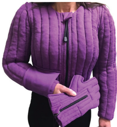
Two Piece Arm Sleeve with optional Bilateral Arms, Padded Torso, Arm Sling & Dorsum Zipper (This option is an additional charge)