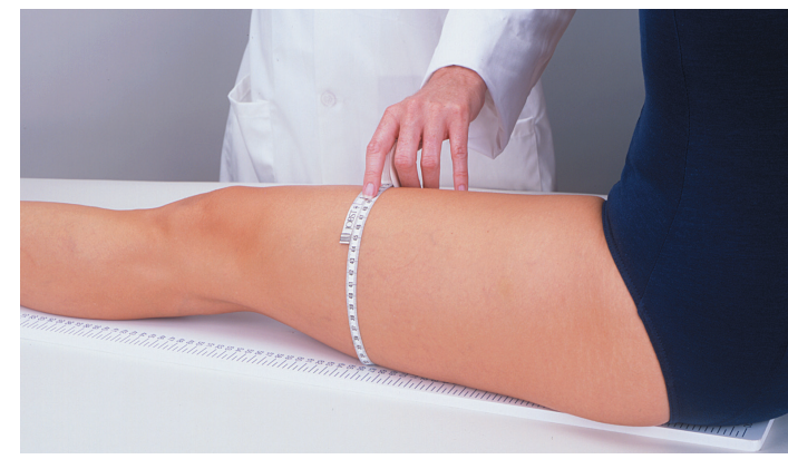
10 Measure circumference F and length F at