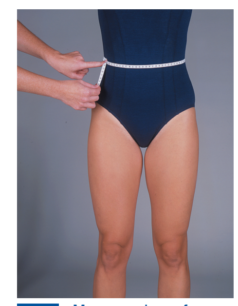
Measure circumference 1 T at the waist.