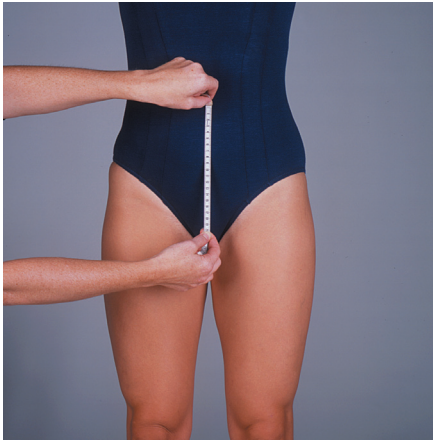
4a FEMALE: K <sub>1</sub>. Measure the length of the pressure panty from the waist to pubic symphasis (beginning of the crotch seam in panties).