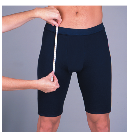
5a MALE: K<sub>1</sub> Measure the length of the pressure panty at the front from the waist to the crotch at the level of the inseam.