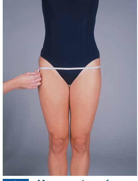
2 Measure circumference H at the level of the greatest circumference around the hips. Length H is taken from this same level to the floor.