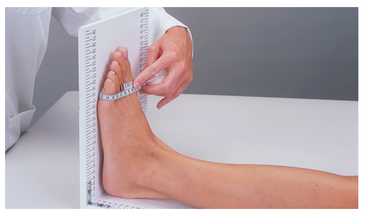
Take circumferential measurement A at the 5th MTP (base of little toe) joint.