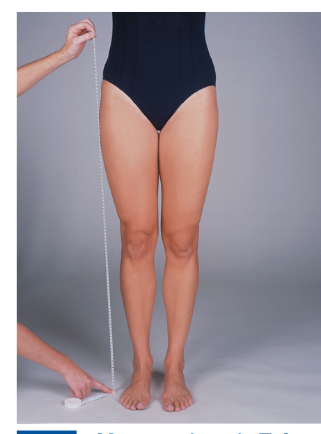
3 Measure length T from the floor to the waist.