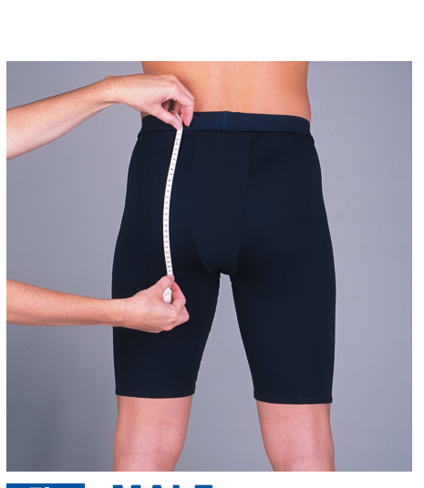
5b MALE: K<sub>2</sub> Measure the length of the pressure panty at the back from the waist over the buttocks as far as the gluteal fold.

For complete measuring and fitting instructions, please refer to Elvarex<sup>®</sup> Measuring CD. We recommend you use an Elvarex<sup>®</sup> measuring board as an aid. Measure when the limb is at its smallest. Place the patient in a supine position (lying down) on the Elvarex<sup>®</sup> measuring board with the heel firmly positioned against the foot portion of the board. If the patient is unable to lie on the Elvarex measuring board, other positions can be used.