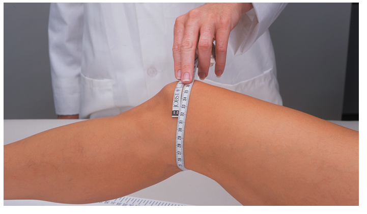
9 Measure circumference E

7 the tibial tuberosity (two finger widths below the kneecap with the leg extended. kneecap).