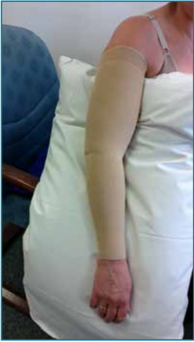
Figures 3 and 4. Case study 2: JOBST Elvarex custom-fit, flat-knit RAL compression class 2 (23-32mmHg) armsleeve from wrist to axilla with SoftFit

and 4). She was impressed with the increased comfort of the armsleeve while maintaining control of her lymphoedema. She described it as: