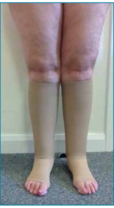
Figures 5 and 6. Case study 3: JOBST Elvarex Soft custom-fit, flat-knit, RAL CCL 2 (23-32 mmHg) knee high with SoftFit