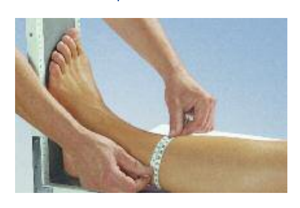
Measure circumference B1 and length a-B1 at the Achilles tendon / calf transition.