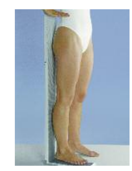
Measure length a-T on the outside as far as the waist, reading off directly from the measuring board. The customer determines the waist height herself with her hand.