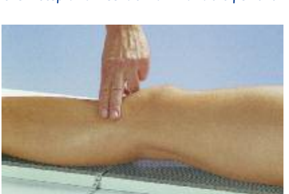
Measure circumference D and length a-D at the fibular head (two finger widths below the kneecap).