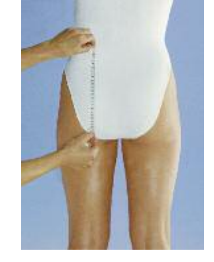
Measure the length of the panty at the back ( K2-T ) over the buttocks as far as the gluteal fold.