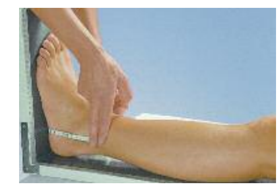
Measurement point P2 : measure from the medial malleolus over the sole of the foot to the lateral malleolus.

60863 RN © 2011 BSN medical Inc. REV 08/11