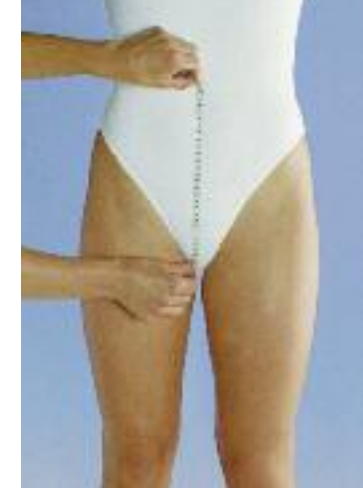
Measure the length of the panty at the front ( K1-T ) from the waist to the crotch.