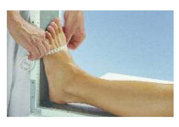
Take circumferential measurement A at the metatarsophalangeal joint.