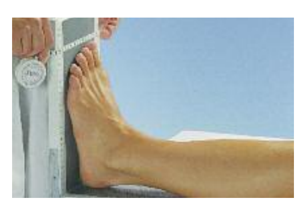
Foot length without tip: from the metatarsophalangeal joint to the end of the heel. Foot length with tip: from the tips of the toes to the end of the heel.