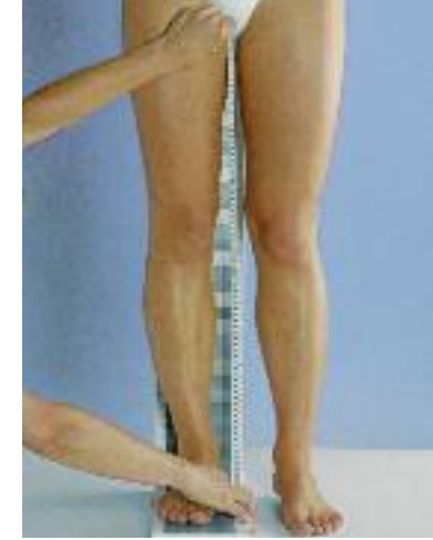
Take the crotch, or K, measurement.