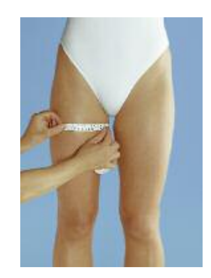
Measure circumference G at the greatest thigh circumference. Measure length a-G posteriorly from gluteal fold straight down to the floor.