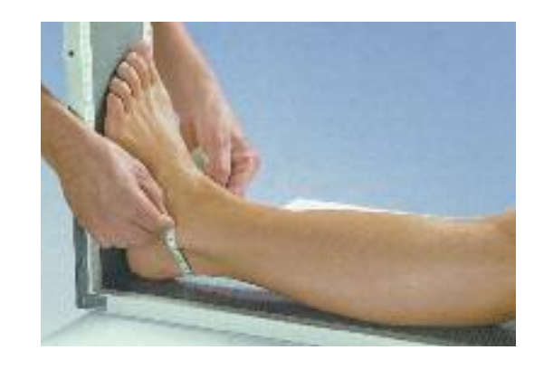
Measurement point P1 : measure from the medial malleolus over the Achilles tendon to the lateral malleolus.

60863 RN © 2011 BSN medical Inc. REV 08/11