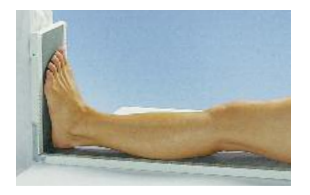
Place the measuring board on a stable surface, place the tape measure, ballpoint pen and size order card in readiness: have the patient place her leg on the measuring board.