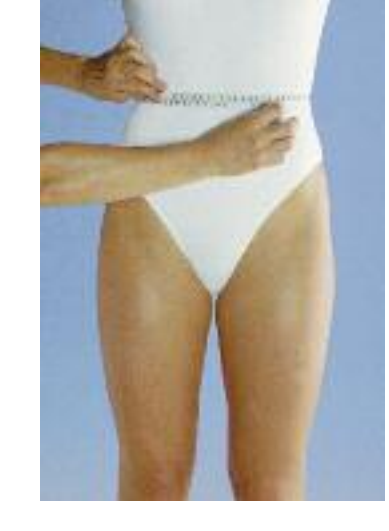
Measure circumference T at the waist.