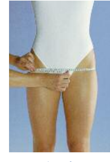
Measure circumference H at the level of the greatest circumference around the