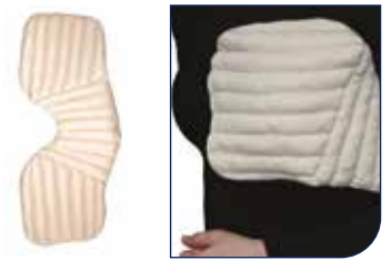
Unilateral Post-Mastectomy Pad