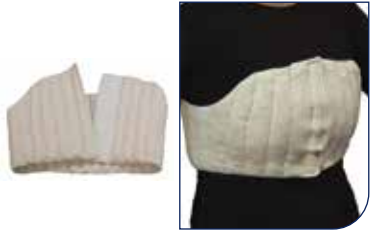
Double Mastectomy Pad