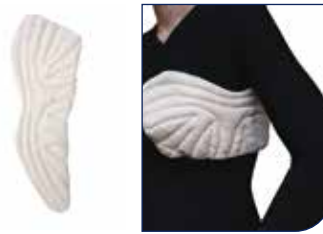
Serratus Anterior Pad