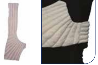
Chest-wall Pocket Pad