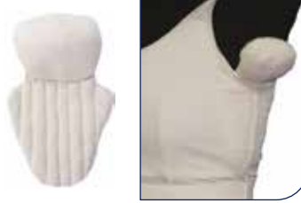
Mini Axilla Pad