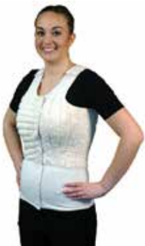
Vest with optional Full Padding (shown with vertical & horizontal padding options for illustration)