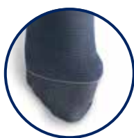
Hallux valgus closed toe