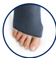
Hallux valgus open toe