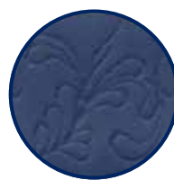
Floral waistband (5cm)